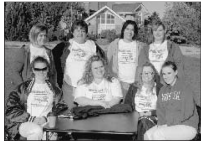
Title sponsor WalMart Volunteers

And the miracles continued. Remember the talk I had with God? Along with putting the event in His hands, I'd made a sentimental request. For the past five, events our goal was $20,000. We've gotten close – but never quite made it. So I asked God for $1,000 for every year PATCH was cele-